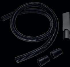
ATEX STARTER KIT Ø 1.75 in