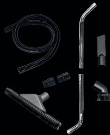
ATEX KIT PRO Ø 1.75 in